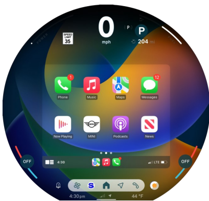
Apple CarPlay® and Android Auto™