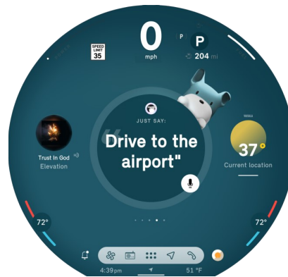
Intelligent Personal Assistant